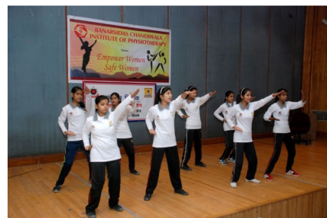
Students of Tehkhand School Demonstrating Self Defence Skills