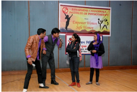
Skit on Women Safety and Self Defence