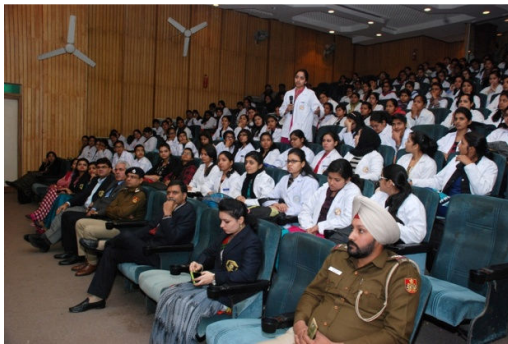
Queries of students being addressed by SHO