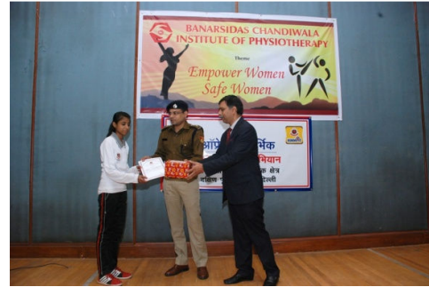
Appreciation and presentation of Memento to the student